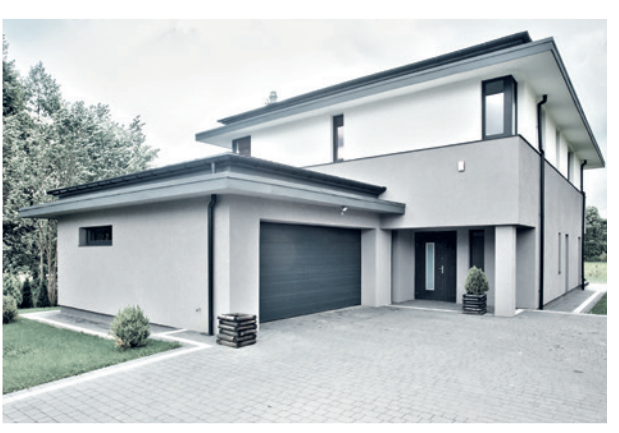
HOME AND GARDEN