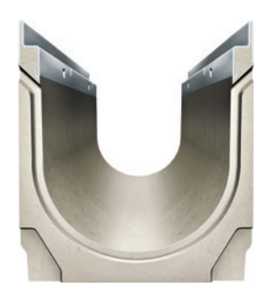
MEADRAIN Professional drainage systems for challenging projects