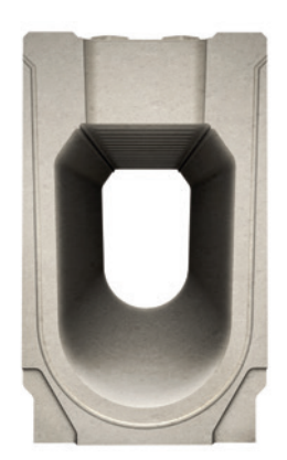
MEADRAIN TRAFFIC Professional drainage systems for roads and highways