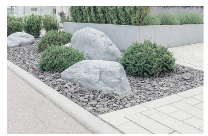
GARDENING AND LANDSCAPING