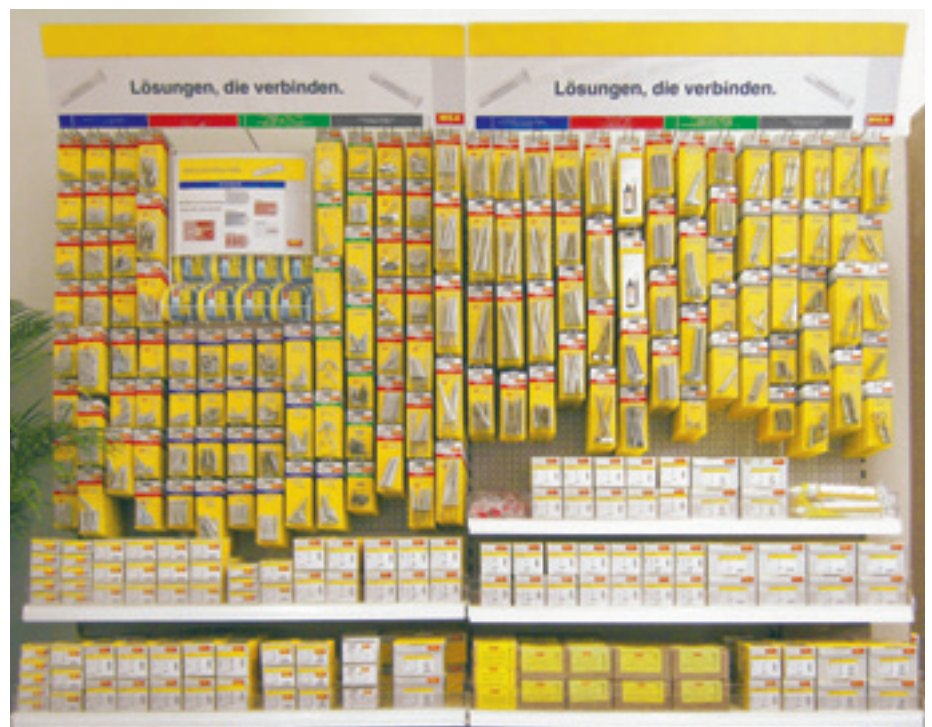
Attractively presented goods, even when some have been sold.

MEA Befestigungssysteme GmbH Sudetenstr. 1 - D-86551 Aichach Hotline: +49 (0) 8251-91 34 00 Telefax: +49 (0) 8251-91 13 88 www.mea-group.com